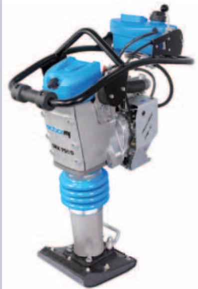
SRX 750 D